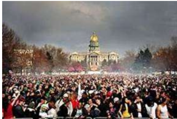
Denver Colorado, April 20, 2017