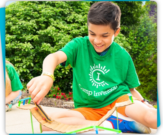
A fifth grader practices tricks — and persistence — with the mini skate park they designed.