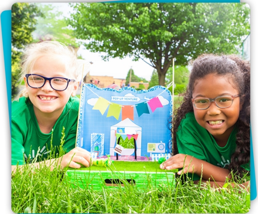
Third graders build collaboration skills as they create their very own pop-up business.