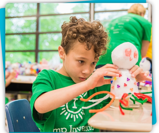
A first grader uses creative problem solving to turn a robot into a stuffie with style.