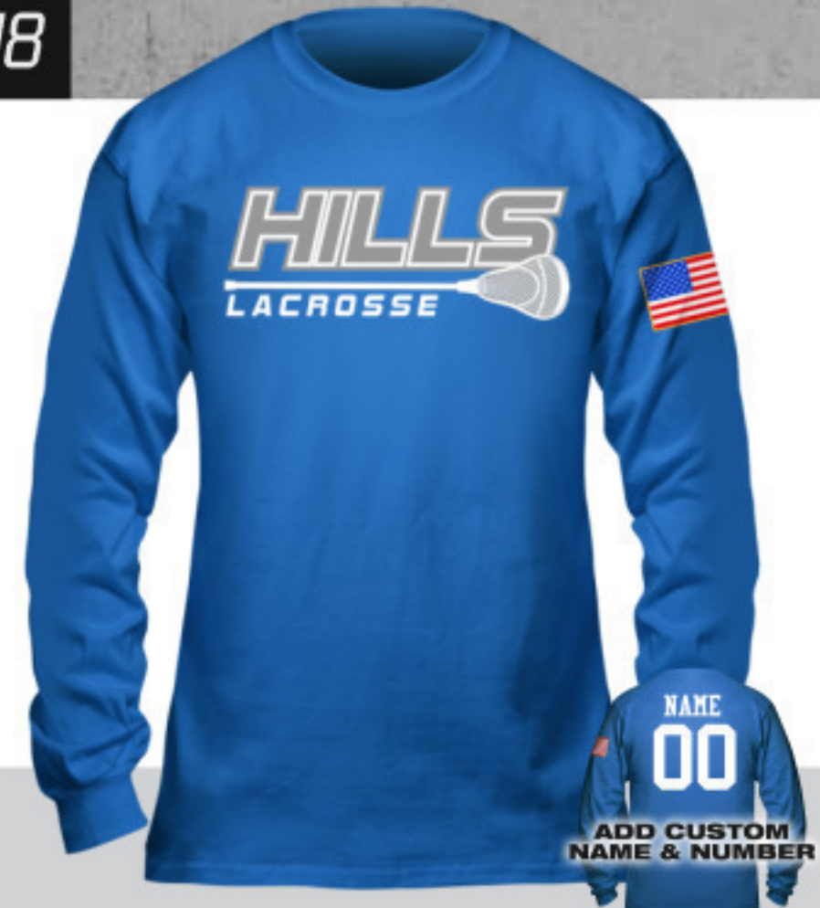
GILDAN LONG SLEEVE T-SHIRT WITH FLAG $25.50