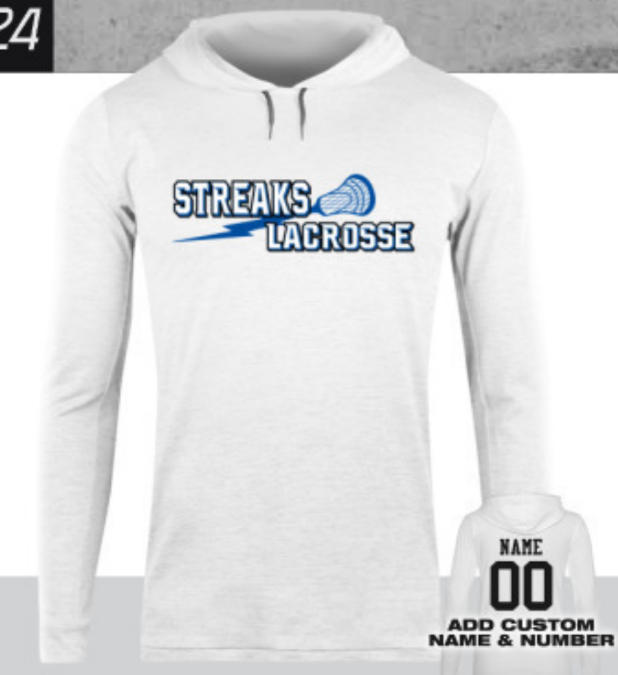
ULTRA FEATHERWEIGHT T-SHIRT HOODIE $29.50