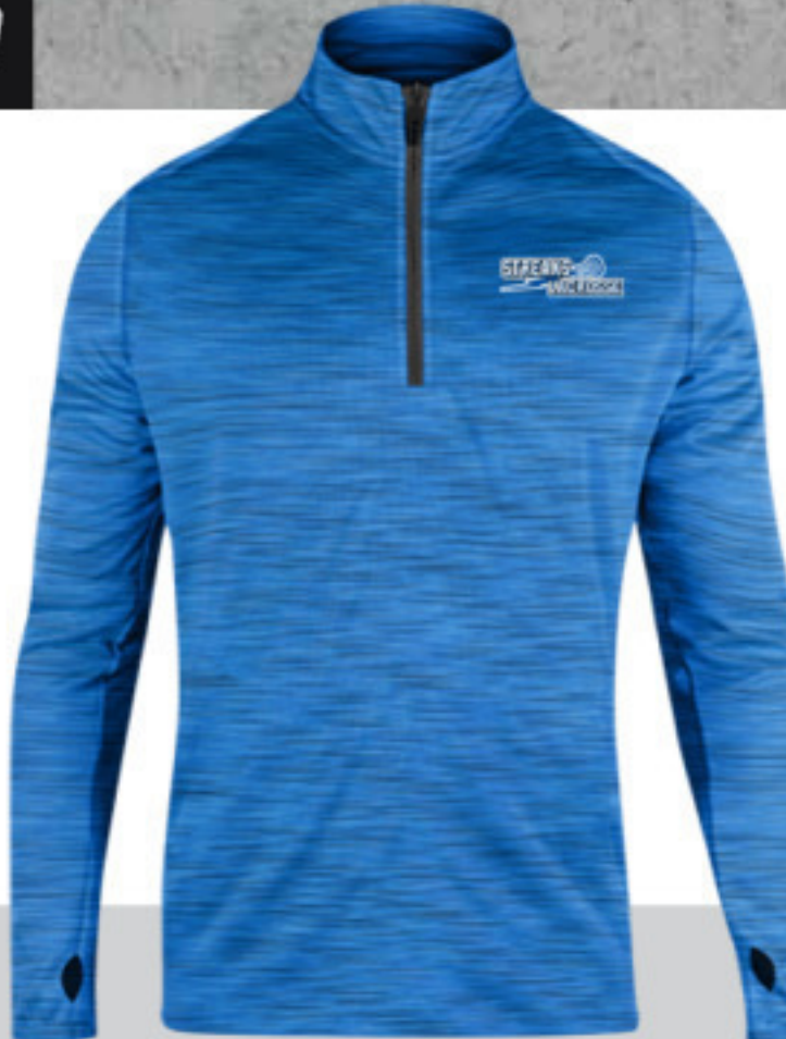
1/4 ZIP DROP TAIL HEATHER PERF PULLOVER $33.50