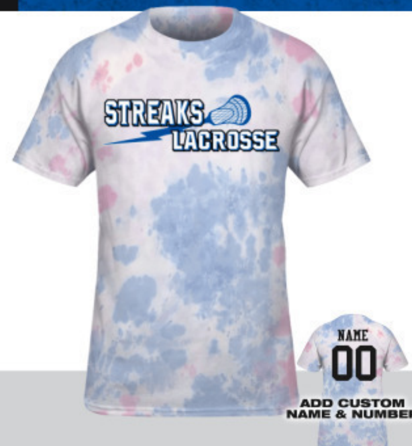
ACRUX UNISEX RETRO TIE DYE TEE $28.50