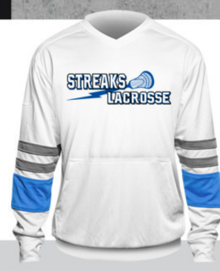
VARSITY POCKETED PULLOVER $39.50