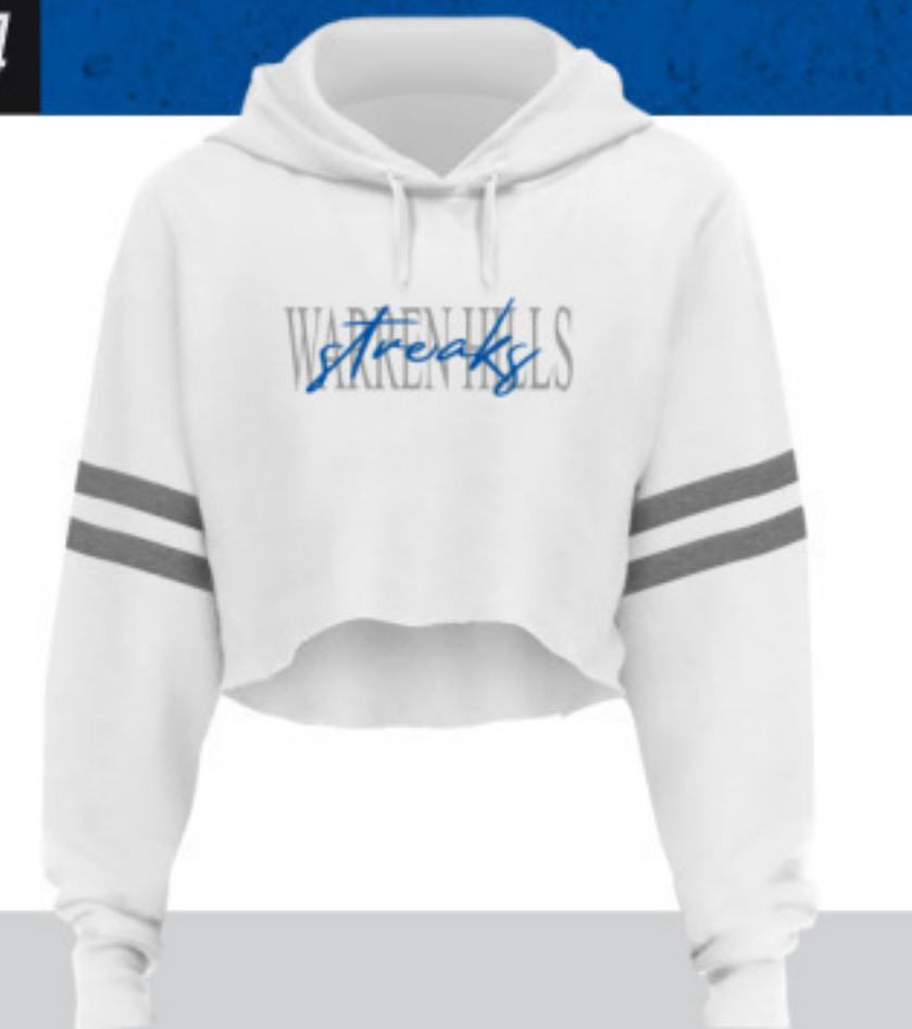
ACRUX WOMENS CROPPED COZY HOODIE $32.50