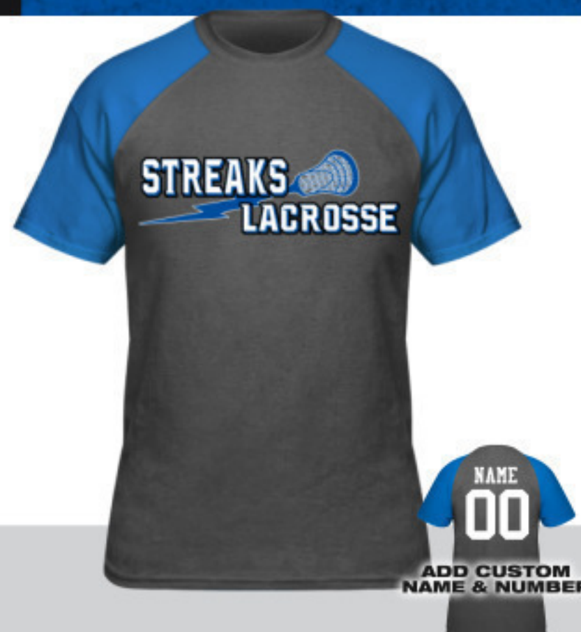
SHORT SLEEVE RAGLAN $22.50