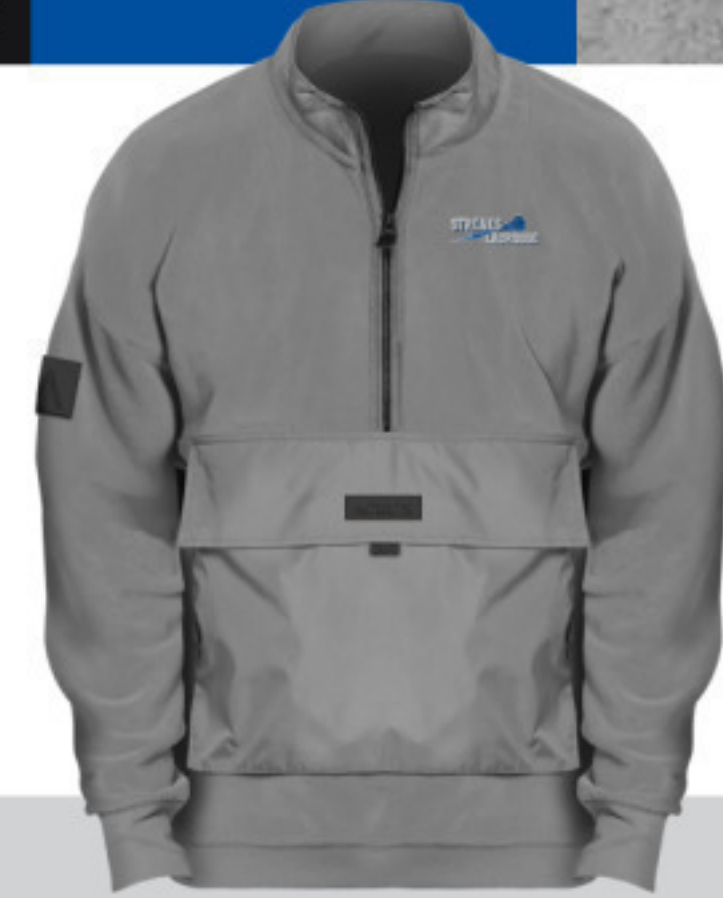
SPORT PULLOVER 1/4 ZIP $42.50