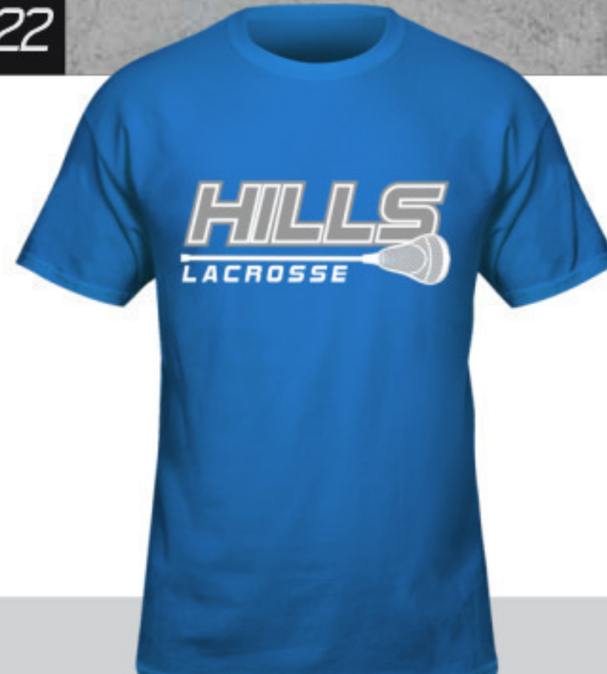
NIKE SHORT SLEEVE COTTON CREW TEE $27.50