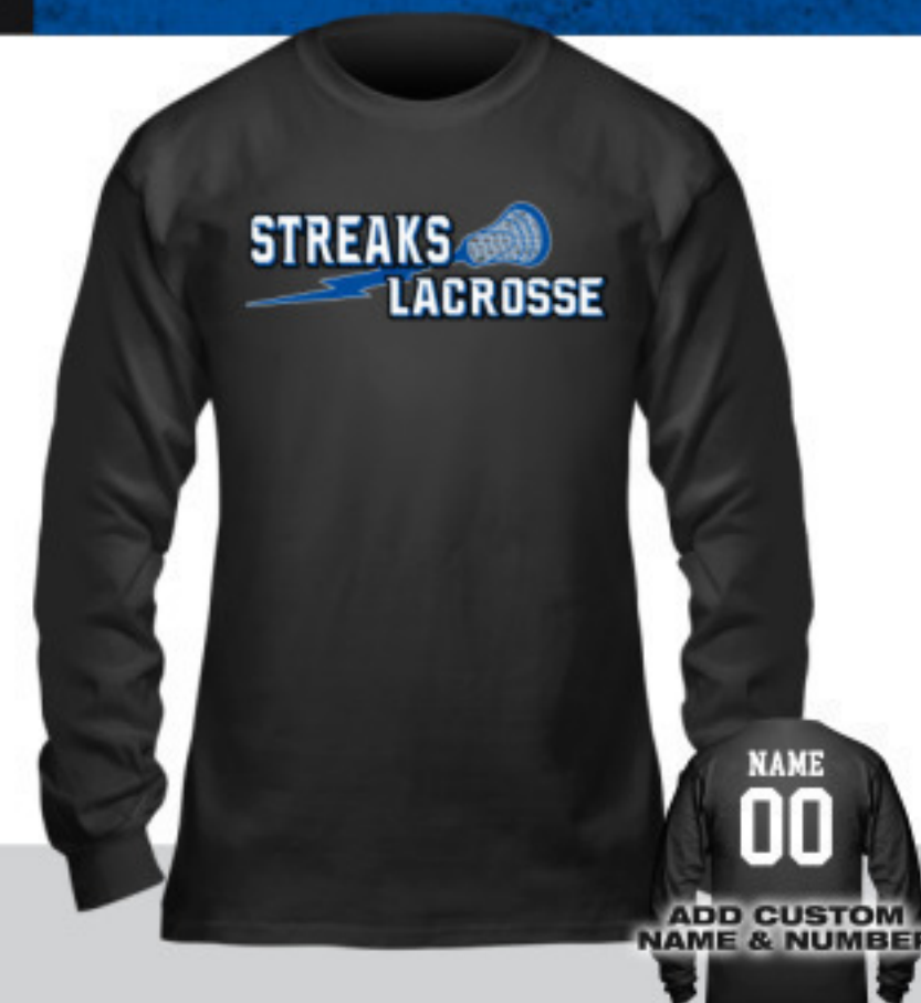
GILDAN 5.3 OZ HEAVY COTTON LONG SLEEVE T-SHIRT $23.50