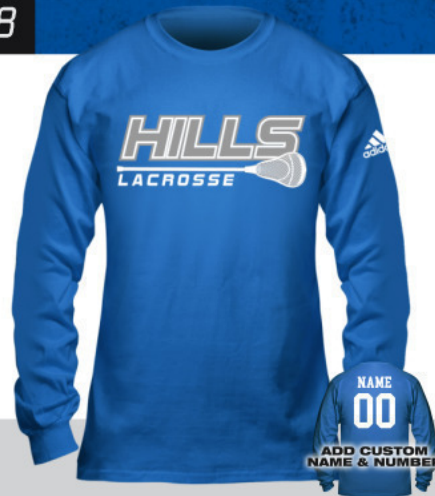
ADIDAS LONG SLEEVE TEE $28.50