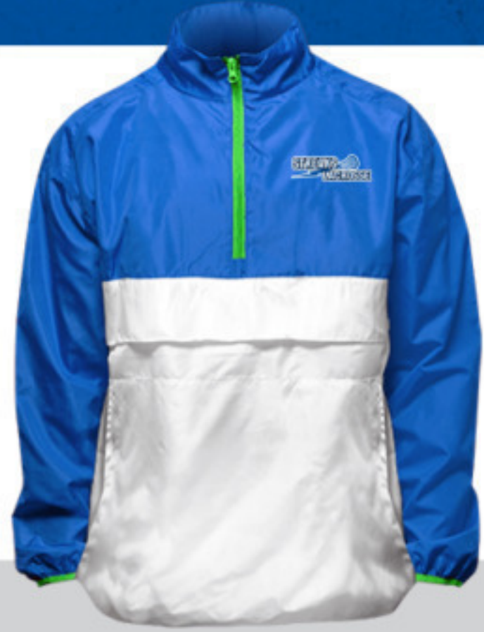
COLORBLOCK WINDBREAKER $42.50