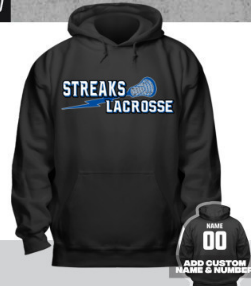
HOODED SWEATSHIRT $31.50