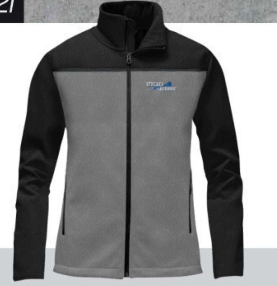
TWO TONE FLEECE JACKET $38.50