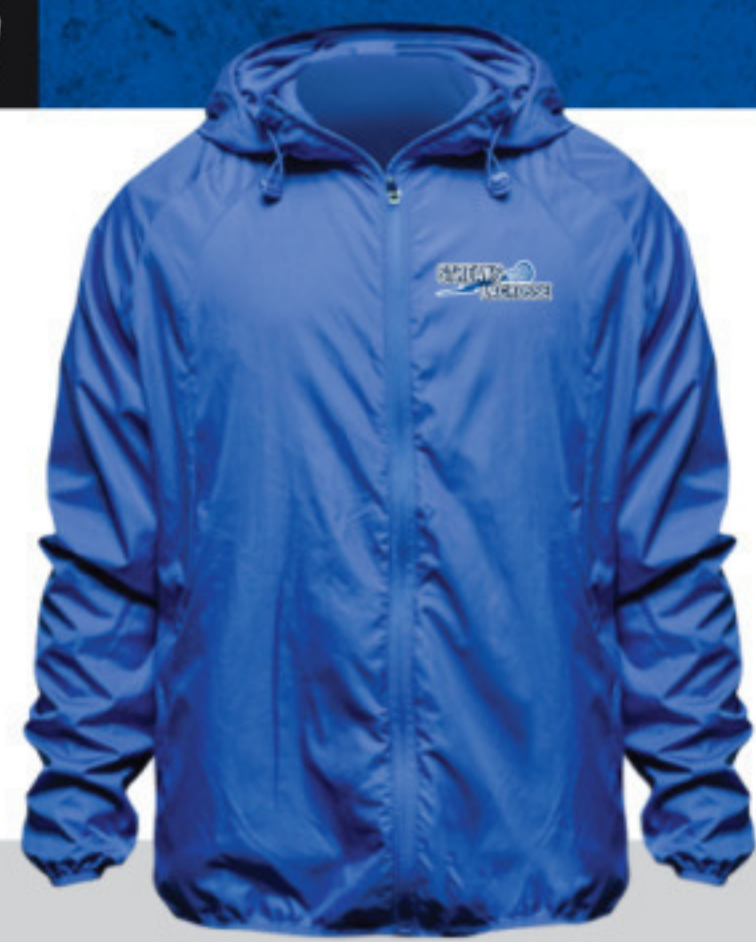
FZ FTHR LIGHTWEIGHT JACKET $39.50