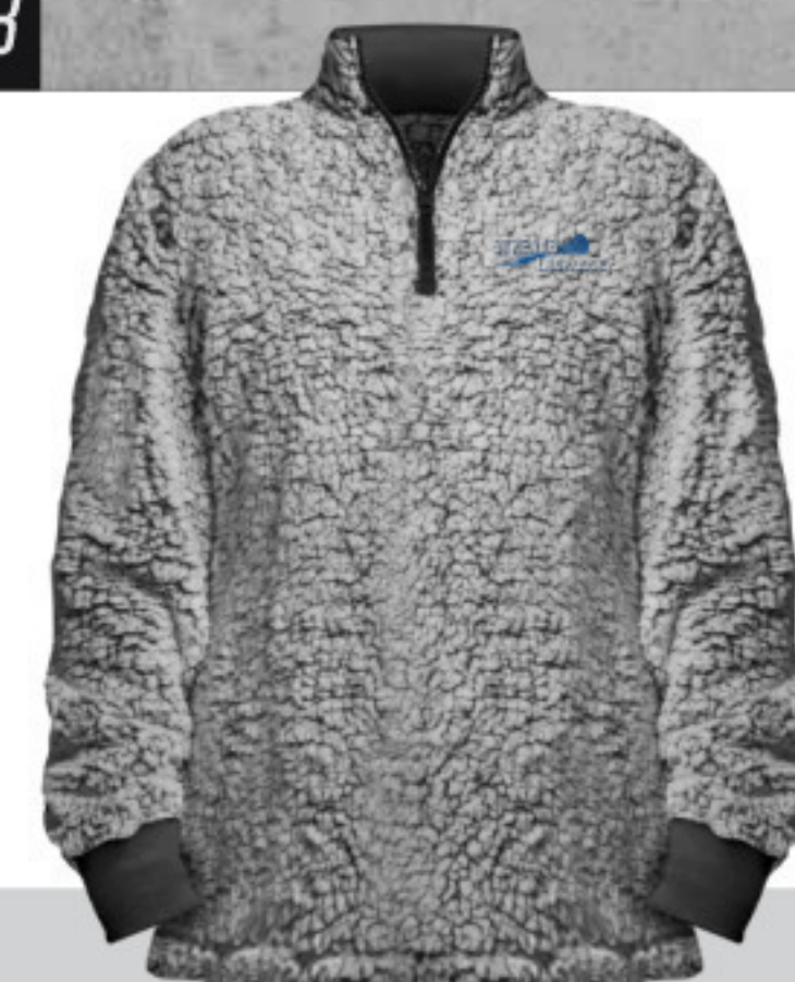
WOMEN'S COLLEGE SHERPA PULLOVER $38.50