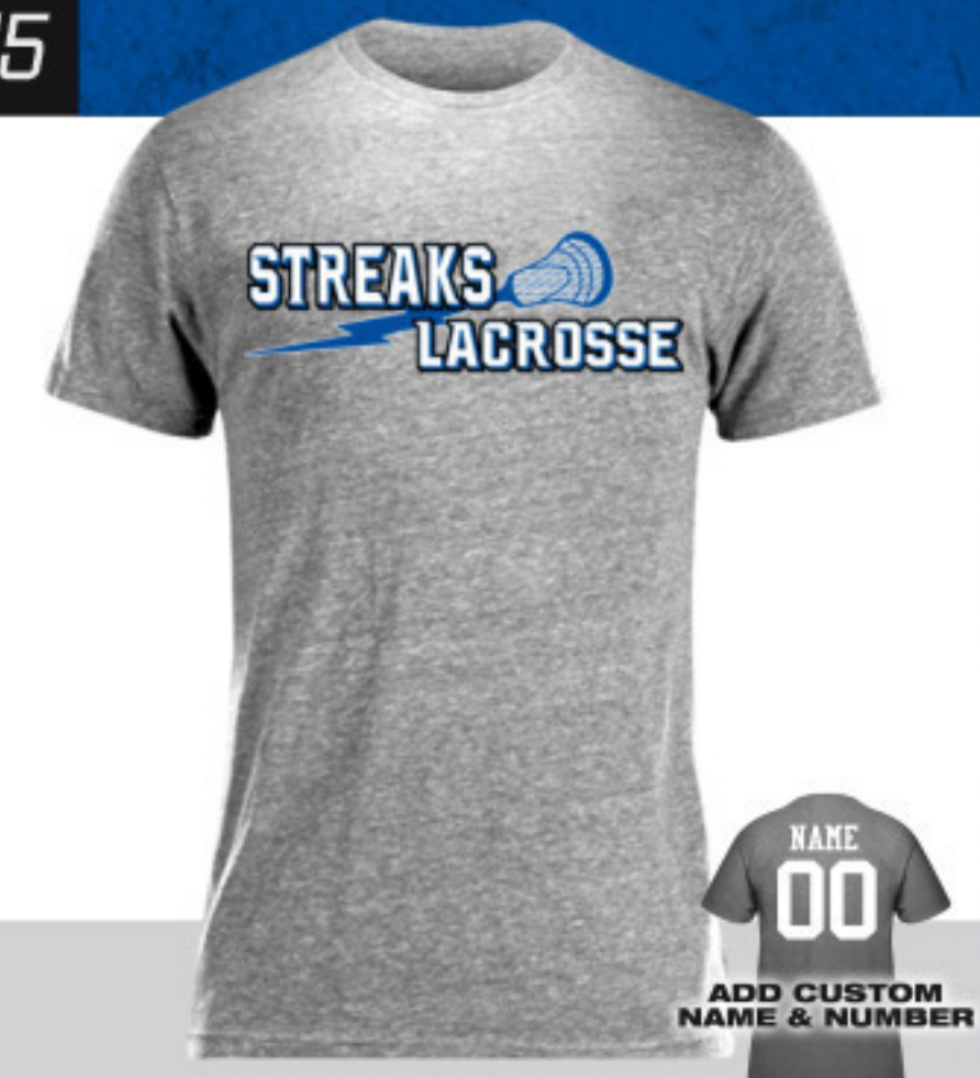
ELONGATED VINTAGE TEE $24.50