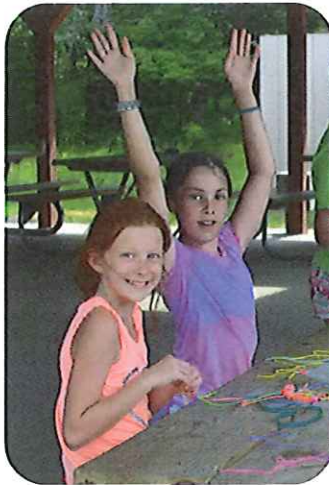
Arts and Crafts!